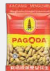
110g x 10 pkts x 6 bags 57g x 20 pkts x 3 bags