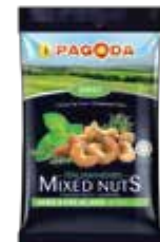
90g x 10 pkts x 3 bags