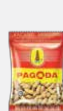
Menglembu Roasted Groundnuts In Shell 万里望花生