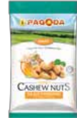
108g x 10 pkts x 3 bags