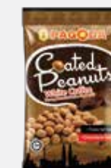
75g x 10 pkts x 3 bags