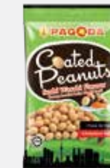
65g x 10 pkts x 3 bags