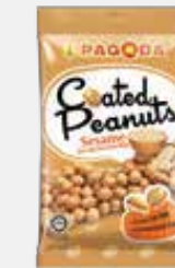
70g x 10 pkts x 3 bags