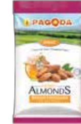
90g x 10 pkts x 3 bags