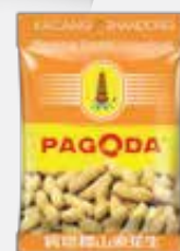
110g x 10 pkts x 6 bags 40g x 24 pkts x 3 bags