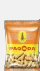
Shandong Roasted Groundnuts In Shell 山东花生