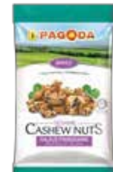
100g x 10 pkts x 3 bags