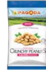
120g x 10 pkts x 3 bags