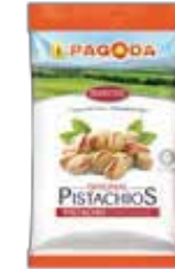
80g x 10 pkts x 3 bags