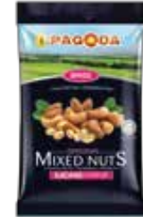
100g x 10 pkts x 3 bags