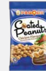
70g x 10 pkts x 3 bags