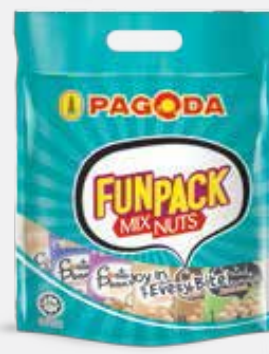
COATED PEANUTS Fun Pack Mix Nuts