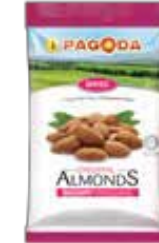
95g x 10 pkts x 3 bags