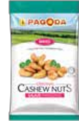
108g x 10 pkts x 3 bags