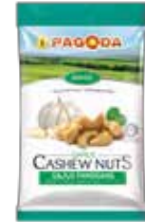
108g x 10 pkts x 3 bags