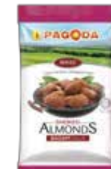
95g x 10 pkts x 3 bags