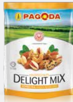
PREMIUM NUTS Delight Mix