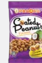
75g x 10 pkts x 3 bags